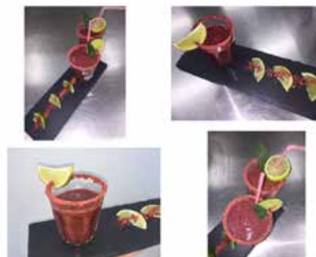
Glowing Skin Smoothie