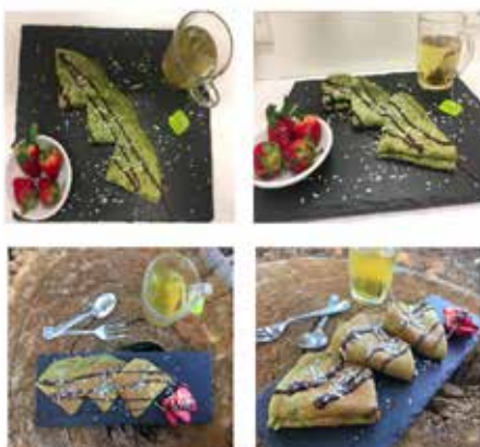
Green Tea Crepes