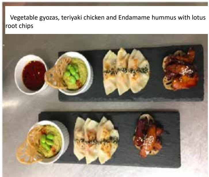
Vegetable gyozas, teriyaki chicken and Endamame hummus with lotus root chips

Throughout 2018, home economics students across the country have been demonstrating their creative flair as they took on the 2018 Recipe Challenge developed by McCormick Foods and the Home Economics Institute of Australia Inc. Entries flooded in from as far afield as Darwin to Kalgoorlie to Kingscliffe, from schools large and small. The judges were stunned with the creativity, cooking skills and explanations of what the young students created.