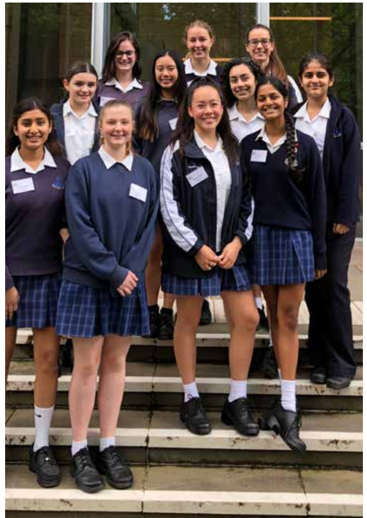
Above: The Year 10 students on the law court steps.