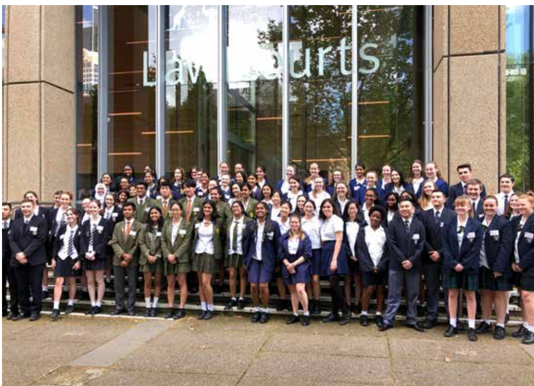
Below: The entire group who took part in The Justice Program