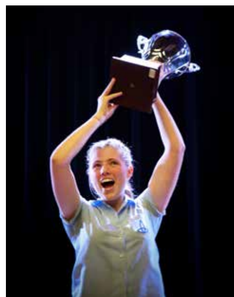
Premier House - O'Harris