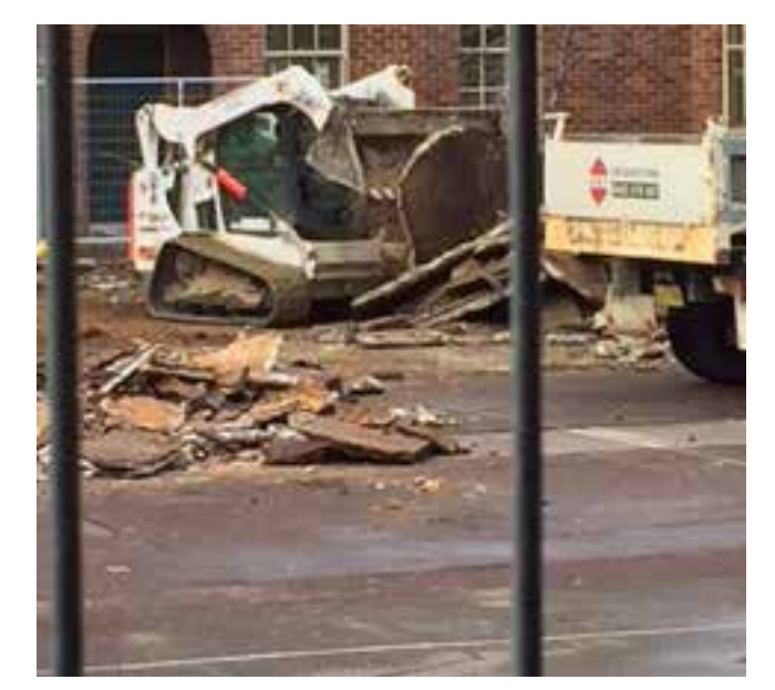
..... the quad surface removal begins