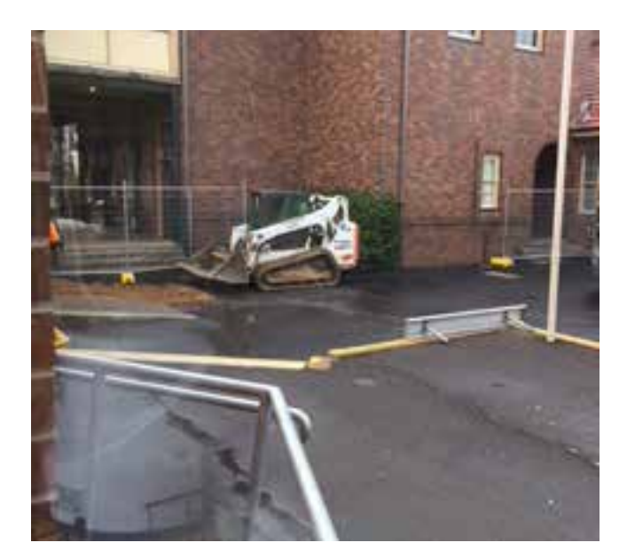
fencing in place, the digger arrives .....