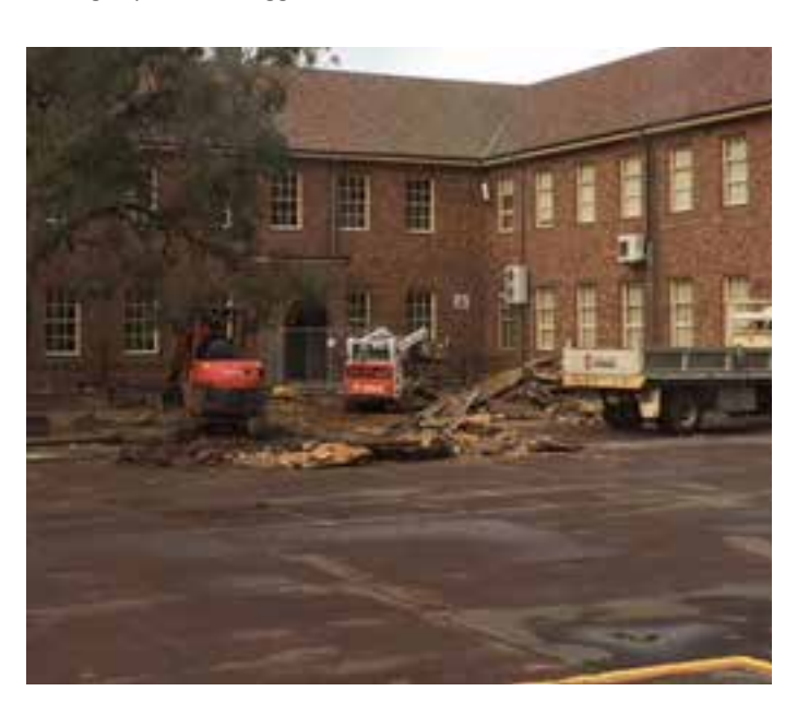
work progresses apace