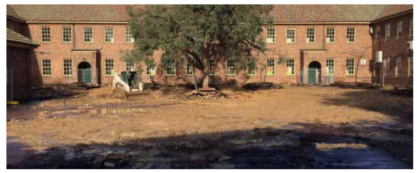
.....and the rains came then out came the sun and work continues ......slowly.